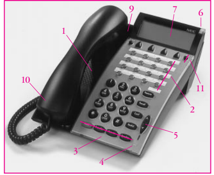
16 Button Display