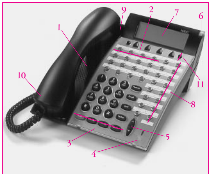
32 Button Display with 16 DSS/BLF One Touch Keys