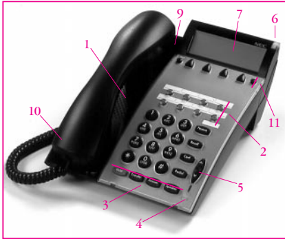
8 Button Display