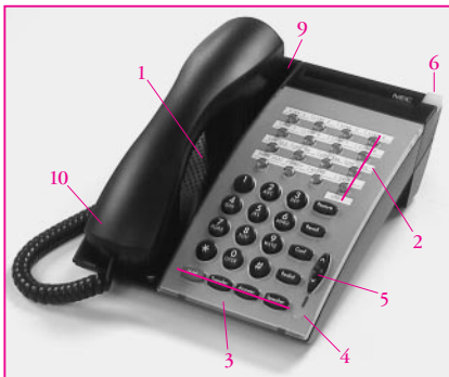
16 Button Non Display