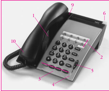
8 Button Non Display